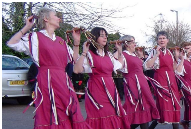
Wolston Village 2007

Most of the dances Chinewrde perform are from the North West Morris tradition. These dances were originally performed in the villages in Cheshire and Lancashire (hence North West), each village having their own dance, for example Ashton, Abram and Peover. The dances were mostly processional in form and were danced in the Wakes Processions during the 19 th Century. The leader would call appropriate figures according to the route.