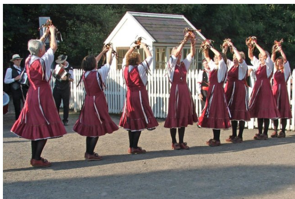
Dancing "Portland Hill" at Blist Hill 2008