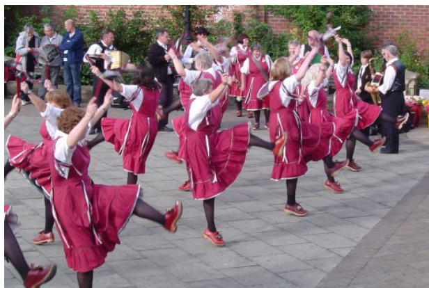
Dancing "Colne" 2007

Chinewrde perform at festivals and weekends of dance (with other Morris sides) all over the country, and also dance at charitable events and local carnivals.