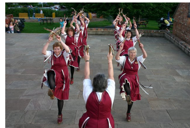
"Hindley" at Newbold Comyn Arms 2008

Charities are very much supported, and each year a few are designated for Chinewrde's donations - which is usually a four-figure sum.