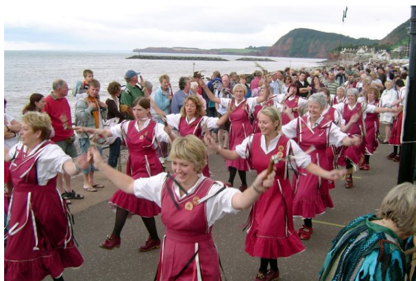
Sidmouth Folk Week 2008