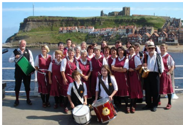
Chinewrde at Whitby Festival 2007